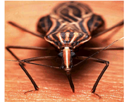
Adult Rhodnius prolixus , a kissing bug.

5:00pm Turn in evaluations, highlighters and saddle your horse