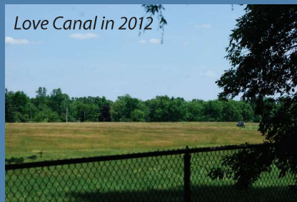
Love Canal in 2012

The Love Canal, located in Niagara Falls, New York, originally was intended to be a canal used for hydroelectric power in the 1800s and