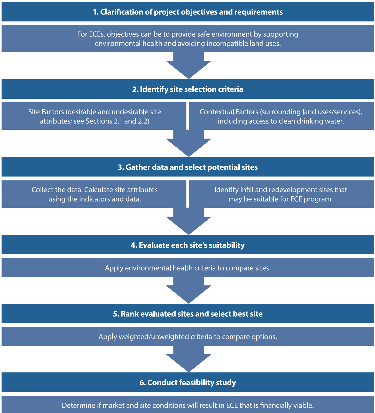
Figure 3. Site selection process, with an emphasis on environmental health and ECE program development. Adapted from LaGro (2013). Copyright © 2013 by John Wiley & Sons, Inc. All rights reserved.