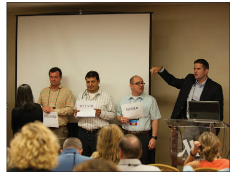
Interactive elements in the educational sessions pulled attendees from their seats.