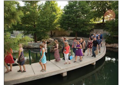
After disembarking the boats, UL Event attendees made their way to the Pearl Brewery District for dinner and socializing.