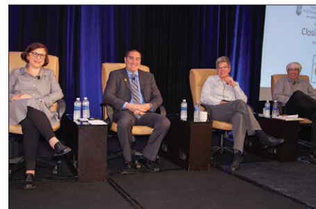
Our closing panelists shared personal experiences in the aftermath of a crisis and the lessons they learned.