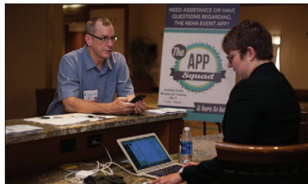
The meeting app was a must in order to navigate the conference and we made sure help was on hand if attendees had questions.