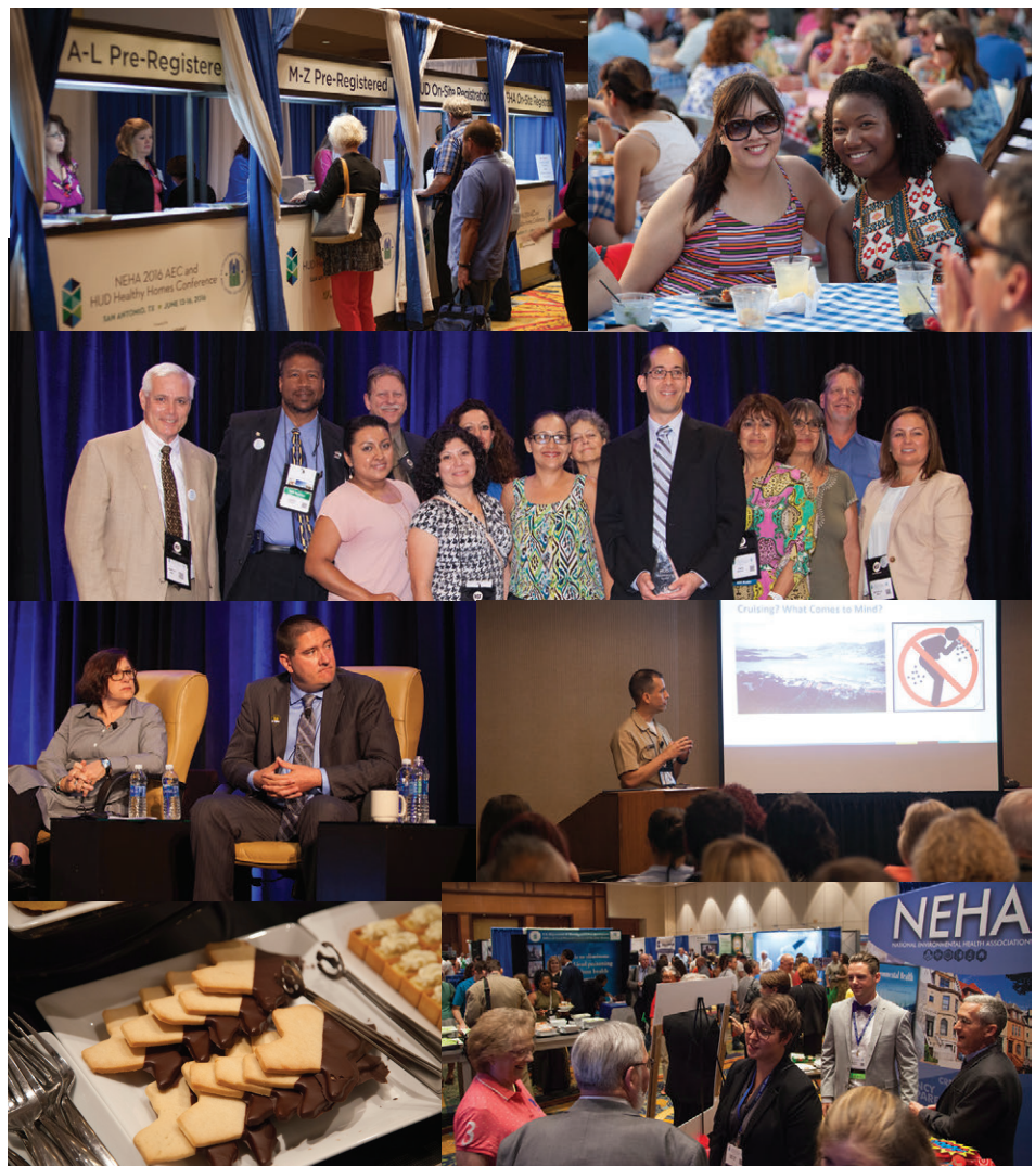
NEHA 2016 AEC photos courtesy of Liz Warburton, Eversnap Photography.

PRESENTED BY Green & Healthy Homes Initiative*