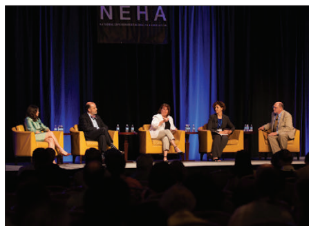
The second panel of the Opening Session explored how collaborative efforts can further the work we do in environmental health.