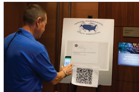
An attendee scores Connect4 NEHA points prior to attending an educational session.