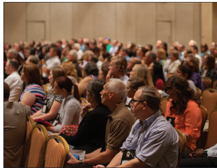
Packed sessions rooms were seen throughout the AEC.