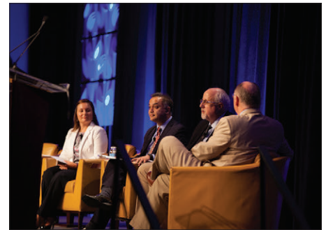
The participants in the first panel discussed environmental health challenges and trends that they face in their respective positions.