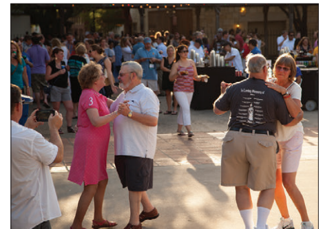
NEHA's leadership takes their lovely wives for a spin on the dance floor.