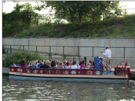
UL Event attendees enjoyed a leisurely boat ride down the San Antonio River, getting to see many unique elements of the Riverwalk.

Other events such as the Exhibition Grand Opening & Party and the Awards Presentation brought attendees together and were hugely successful. Planned and impromptu, there were numerous meetings, dinners, and happy hours where attendees shared insights and knowledge, and were able to just kick back and enjoy the company of each other.