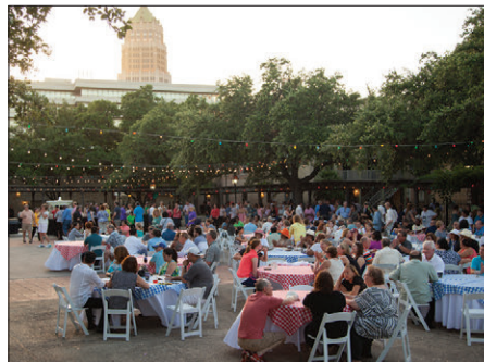
Texas Social attendees were able to network and catch up on the week's events in a beautiful setting accompanied by barbeque and drinks.