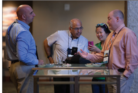
With so many educational sessions to choose from, attendees relied on the meeting app and each other to figure out which ones to attend.

“What a great place and opportunity to meet with your fellow environmental health specialists to collaborate, learn, and work together to provide a stronger professional foundation to share within your communities across the country.” – AEC attendee