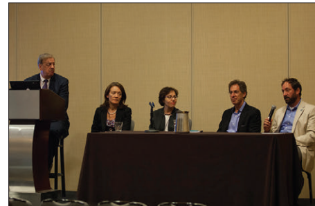
A panel packed full of experts enlightened audience members on the importance of communication regarding climate change and public health.