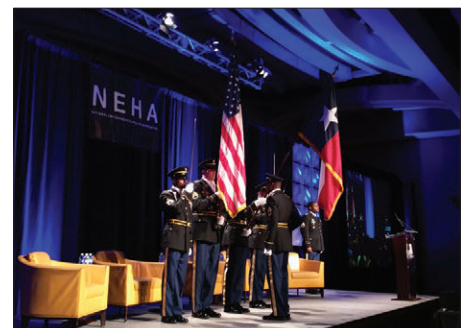
The color guard from Fort Sam Houston opened up the AEC with a moving display of our national flag and an amazing live singing of the national anthem.