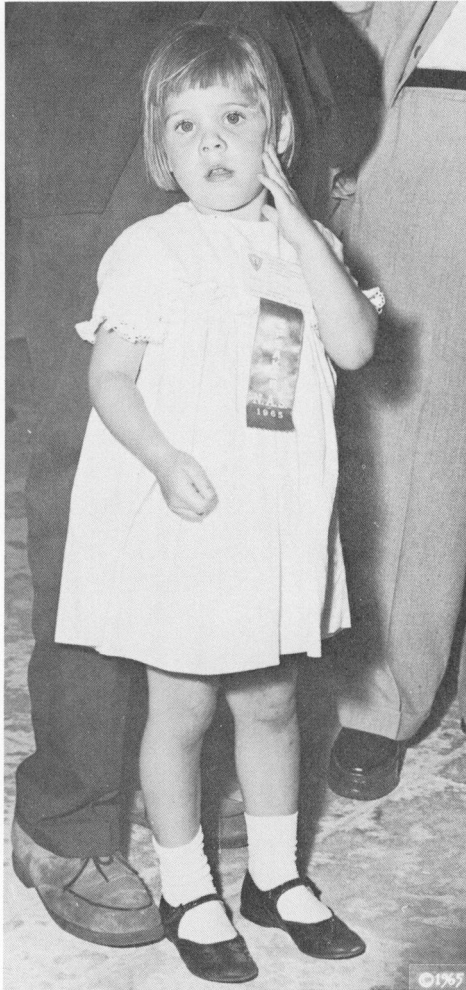
Guess who the speaker is?

authorities as a fundamental human need, delineated modern concepts, practices, and programs directed toward the control of factors which may affect the achievement of adequate shelter for people. Again, a well selected panel of experts discussed public health's obligations in the field as they relate to planning and operating effective community housing programs, the enforcement of codes and regulations and relocation, rehabilitation and urban renewal administration.