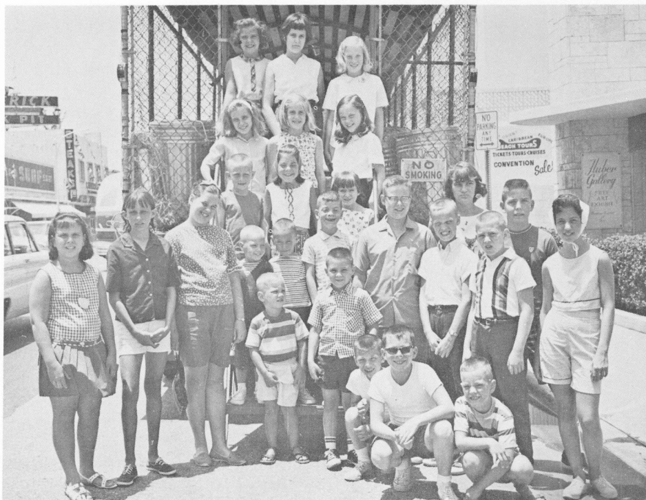
Nolen's Hayride was one of the most popular features of the children's entertainment program included in the Miami meeting.